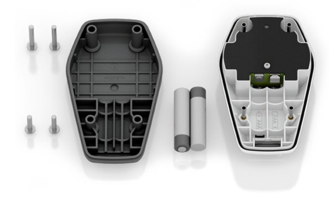
Figure 4: Disassembled View with batteries oriented in correct polarity