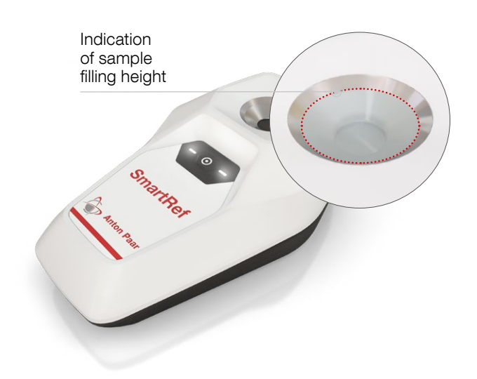
Figure 2: Sample Area